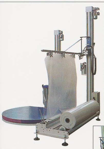
Automatic top-sheet dispenser

The values marked with * indicate a standard version.